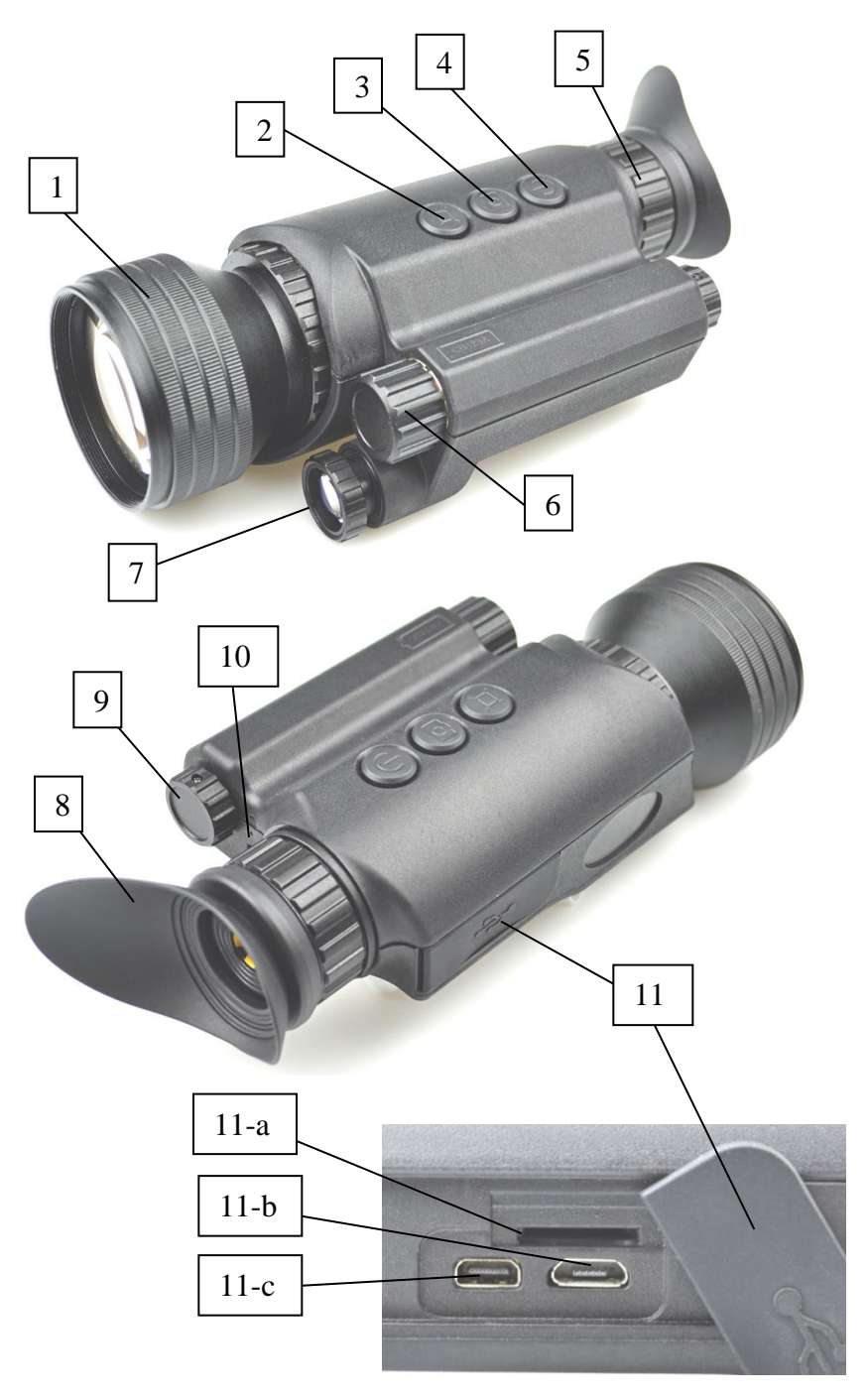
Please identify all the parts of the device PRIOR to operation! (50mm lens shown, 44mm version is identical in all parts except the lens size)