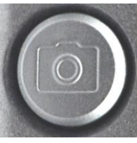
IMAGE BUTTON (2)